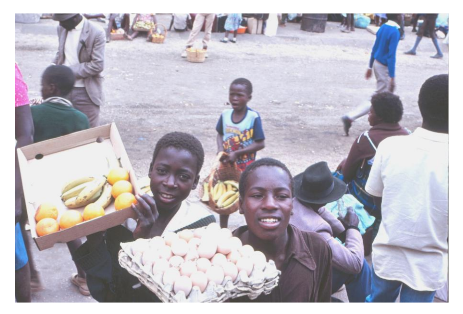
The market stalls come to the bus window

Long distance buses were notorious for their unpredictable departure times, often hours after the scheduled time. Passengers would start arriving with their katundu or baggage prepared for a wait, which they invariably did without complaint. The drink and food sellers from the adjacent market took advantage of this isolated transient group. The peaceful scene of the waiting passengers would explode into confusion as the bus came into sight amidst plumes of diesel smoke and swirling dust. The bus would be surrounded on all sides, not just a crowd by the door, with shouts and gestures between passengers and staff as to how their bags were to be placed. Bus staff on the roof manhandled all the bulkier goods aloft, while the interior filled up with passengers and none-roof cargo. The bus appeared to slip into the background as its outline blurred against the numbers of people and baggage either on the roof or standing around the windows pushing in plastic shopping bags or cardboard boxes.