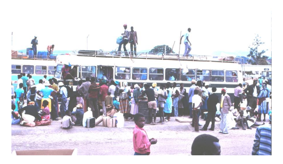
Boarding through windows is allowed. Long distance bus travel is often an adventure

I have been on rural buses with the aisle between the seats filled with scrap metal and bags of maize stacked halfway to the roof. Entry and exit was only possible by actually climbing up the side of the sacks, crouching over their tops and dropping off the other side. But it did mean there was a natural barrier to keep the small pigs and chickens in their place.