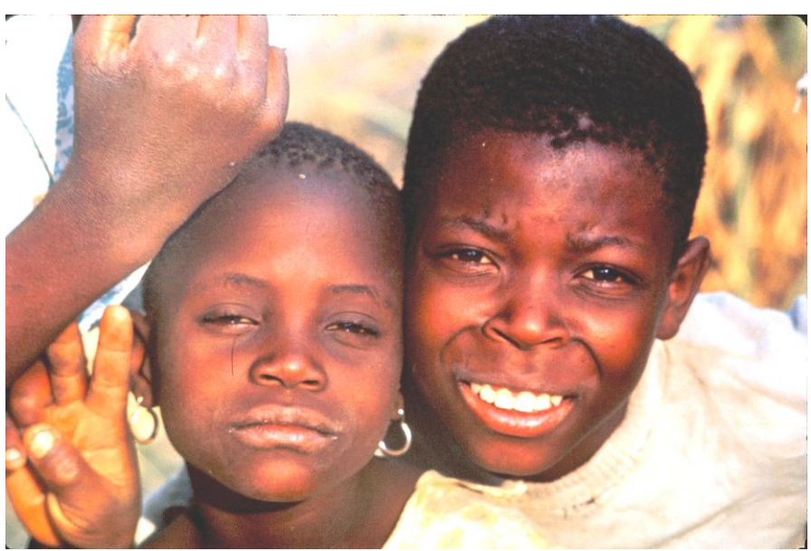
Children from the townships. They are the future